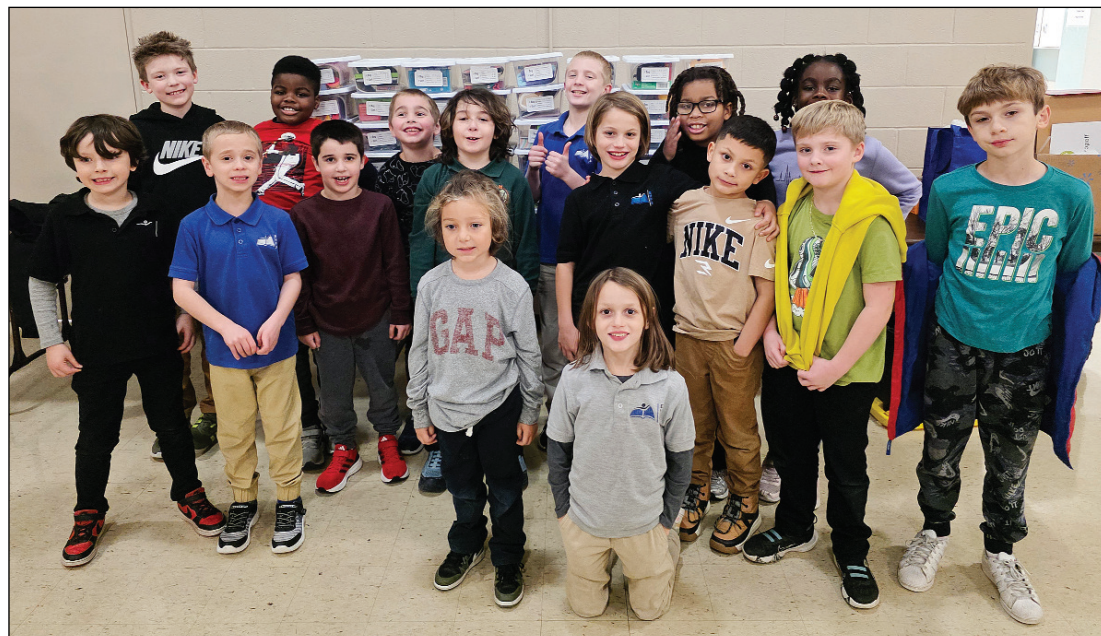
MEMBERS OF CUB SCOUT PACK 61 stand in front of completed gift boxes destined for CCMC in Hartford.

Cub Scouts is part of Scouting America for kids in elementary school, Kindergarten through 5th grade. Here, they learn about the outdoors, how